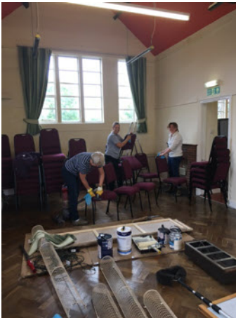
A busy day

Thank you, Oxhill Village Hall Committee