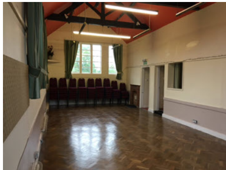
Leading to a Great Result